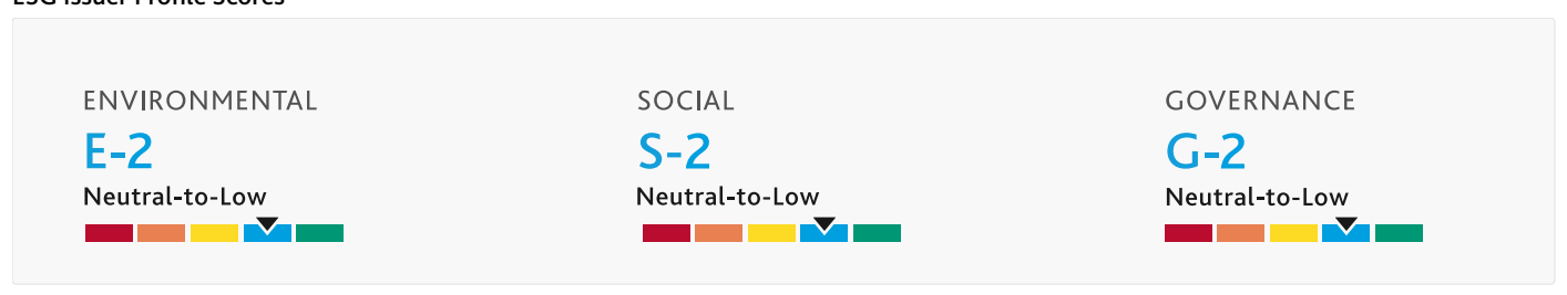
Exhibit 3 ESG Issuer Profile Scores

Pennsbury School District's ESG Credit Impact Score is neutral-to-low (CIS-2), reflecting neutral-to-low exposure to environmental, social and governance risks.